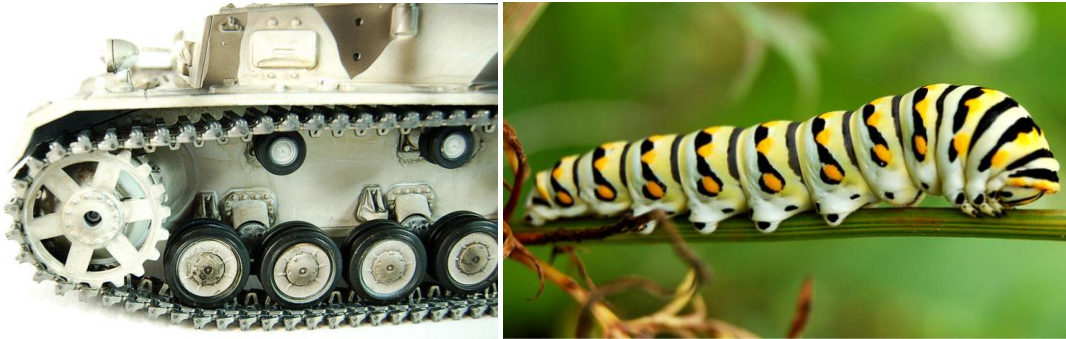
Tank Tracks like a caterpillar

Jeremiah also describes the Horses in the end time as caterpillars which tanks do look like with the tracks that they have on the Bottom, “cause the horses to come up as the rough caterpillars” (Jer 51:27).