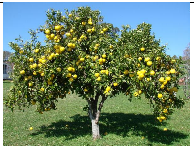
The tree of life represented God's way of life and, above all, it stood for God's eternal life. The tree of the knowledge of good and evil represented the way of disobedience and outright rejection of God's revealed knowledge.