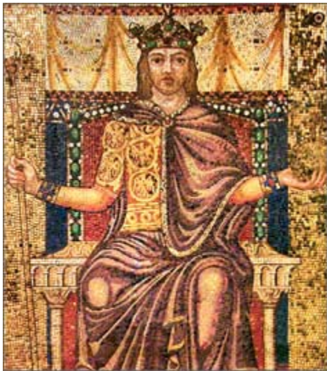
Otto the Great, crowned in A.D. 962

“Thus once again the ghost of the Roman empire was summoned to sanction the successful state building of a semi-barbarian king” (William McNiel, Handbook of Western Civilization , p. 317). The coronation of Otto the Great as emperor marked the inauguration of the third head in the continuity of the restored Western Empire.