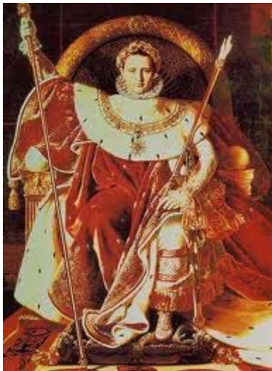
Coronation of Napoleon

Meanwhile, the Hapsburgs of Austria, who maintained their claim on the title of Holy Roman Emperor, were hit hard by the successive military and diplomatic advances of Napoleon—including his assumption of the imperial title. This was particularly so when, two years after he did so, 16 princes and their states withdrew from the Hapsburg's Holy Roman Empire, formed the Confederation of the Rhine and asked Napoleon to take them under his protection as a part of his empire. The following month, on August 6, 1806, Francis II of Austria renounced his now-empty title of Holy Roman Emperor. Napoleon's European empire now stretched from the Atlantic Ocean to the Elbe River. France, Spain, Italy, Holland, Belgium, Germany and all French and Spanish New World territories—the greater part of the Americas—formed his vast empire. Napoleon thus became the fifth head of the revived Western Imperium .