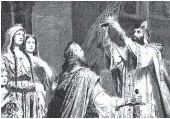
The Coronation of Charlemagne

Both “heads” mentioned so far—Justinian and Charlemagne—were allied with the bishop of Rome, having arisen at papal behest and with papal blessing. Historian Will Durant explains, “Out of this intimate cooperation of Church and state came one of the most brilliant ideas in the history of statesmanship: the transformation of Charlemagne’s realm into a Holy Roman Empire that should have behind it all the prestige, sanctity, and stability of both Imperial and papal Rome ” (p. 468).