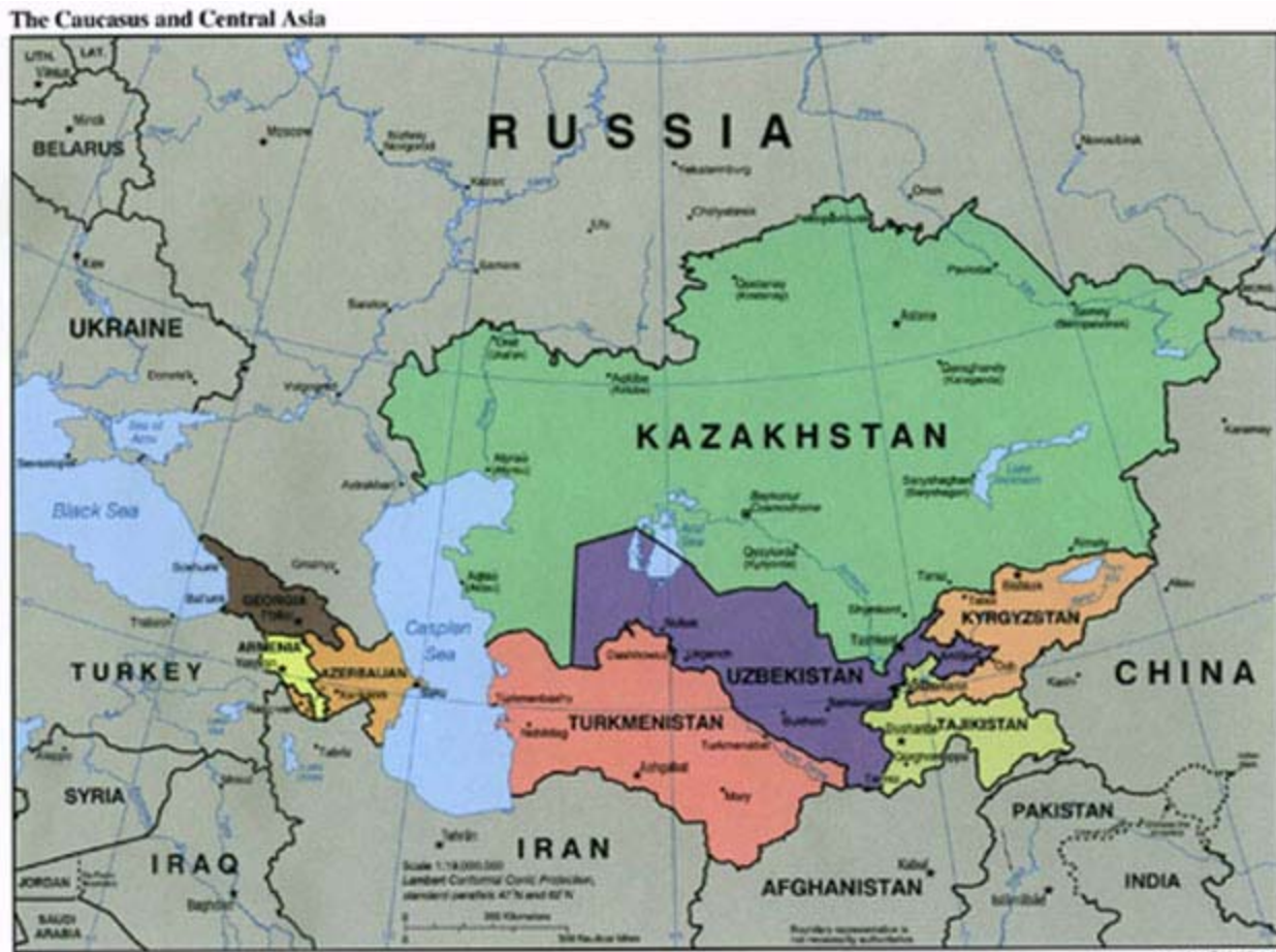
Map of the Modern Day House of Togarmah and all his Bands