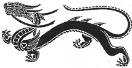
Fig. 8 - Image of Dragon in Han Dynasty