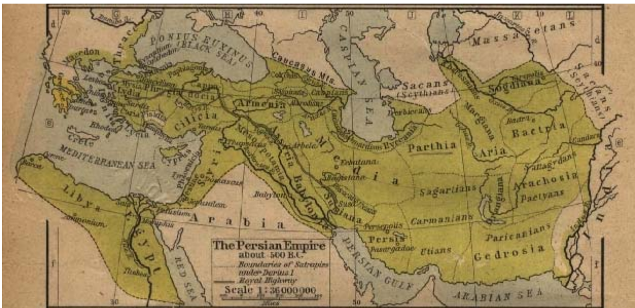
Map of Persian Empire shows Bactria with the Amu (Oxus) River, the Indus River and the Syr (Jaxartes) River running through the Bactria Region

In this area we find a river called the “Amu Darya” Oxus by the Greeks. This river was “traditionally known to the Western world from Greek and Roman times as the Oxus and was called Jayhun by the Arabs. It allegedly derives its present name from the city of Amul, which is said to have occupied the site of modern Chärjew in Turkmenistan . Well known as it was in antiquity and to the Arabian geographers of the 2nd and 3rd centuries” (Encyclopedia Britannica, under article “Amu Darya,” emphasis added). Of course the “Amu” is the Amalekites that were transported from Egypt to Seir to Persia and India.